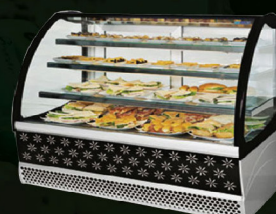
Bakery/Desert Display Chiller Unit