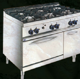
6 Burner Gas Range with Oven