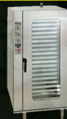
Convection / Combi Steam Oven