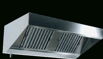
Wall Type Exhaust Hood