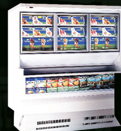
Dairy/Meat/Poultry Multideck Display Chiller/Freezer Unit