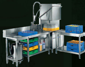
Hood Type Dish Washer