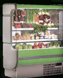
Vegetable Display Unit