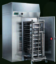
Blast Chiller Flash Freezer