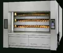
Fixed Deck Oven