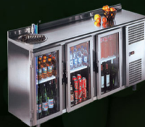
Counter type Glass Door Chiller