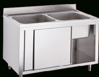
SS Sink Unit