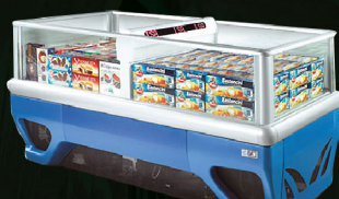
Pizza Display Warmer