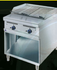
Lava Rock Grill