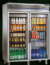
Glass Door Chiller