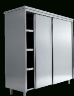
SS Vertical Cabinet