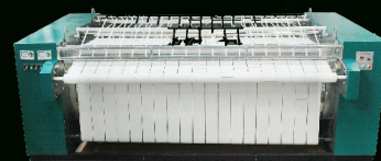
Flat Work Ironer