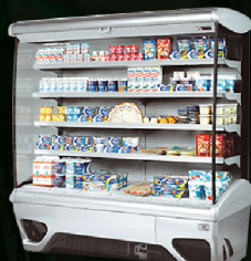
Dairy Display Multideck Chiller Unit