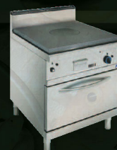
Solid Top Range