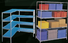
Polymer / Wire Shelving