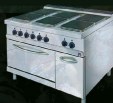
Electric Hotplate with Oven