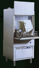
Hood Type Pot Washer