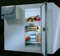
Cold Room (Chiller / Freezer)