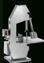
Bone Saw Machine