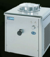
Ice Cream Machine