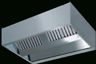
Island Type Exhaust Hood