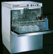
Under Counter Dish/ Glass Washer