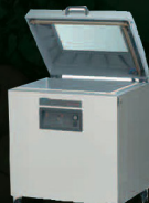
Vaccum Packing Machine