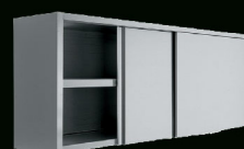
SS Wall Cabinet