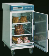
Cook & Hold Oven