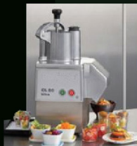
Veg Cutting Machine