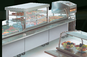
Self Service Pickup Counter