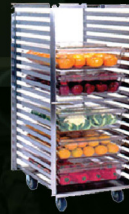
Tray Rack Trolley