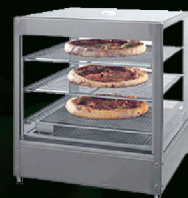
Pizza Display Warmer