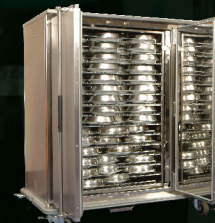
Hot / Cold Banquet Trolley