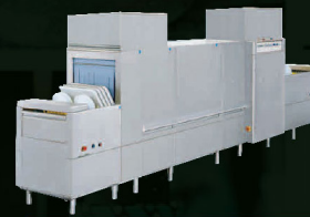
Conveyor Dish Washer