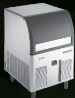
Ice Cube/ Flake Machine