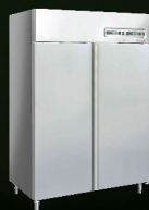
Vertical Chiller / Freezer