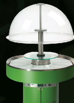
Round Buffet Counter