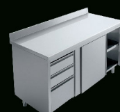
SS Neutral / Heated Cabinet