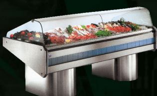
Fish Display Counter