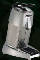
Lever Citrus Juicer