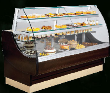
Dessert / Bakery Display Chiller