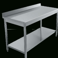
SS Work Table