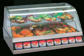
Hot & Cold Display Showcase