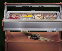
Island Buffet Counter