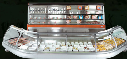
Dairy/Meat/Poultry Multideck Display Chiller/Freezer Unit