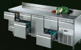
Counter type Chiller / Freezer