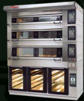
Modular Deck Oven