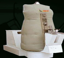
Form Finishing Machine