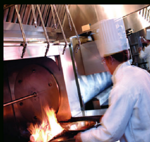
Fire Fighting System